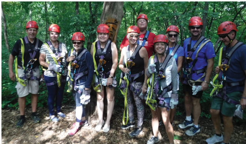
Some of the 70 FISA members who went zip lining.