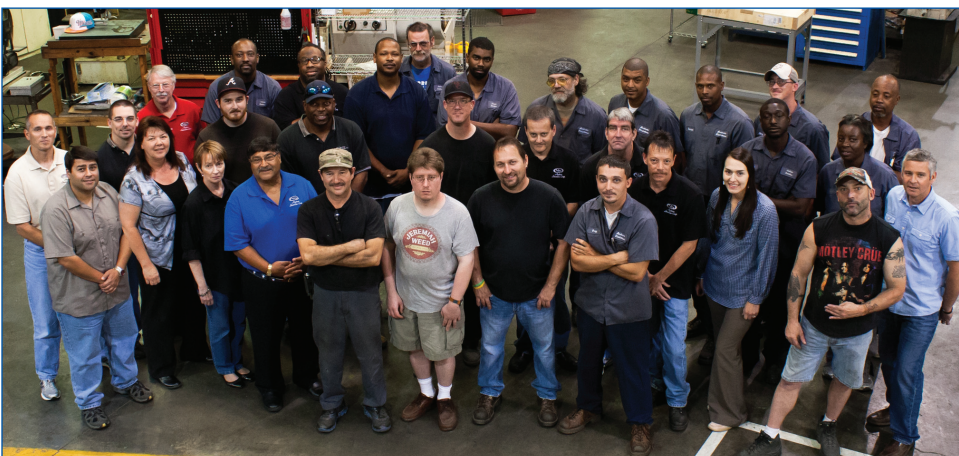
Andron Stainless employees

Andron Stainless Corporation is proud to announce they are celebrating their 20th anniversary this year. Andron opened its doors in 1993, in a small facility northeast of Columbia, SC. Today, Andron has grown into a company with 34 employees and specializes in custom fabrications. In addition to their full line of fittings, valves, strainers, and accessories, Andron is also proud to announce, starting this past March, they began carrying the Inoxpa line of centrifugal and PD pumps.