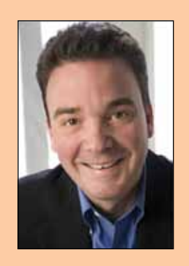
By Bob DeStefano

Do you want specific recommendations on how to turn your Website into a lead generation machine? Then, sign up for our popular Website Analysis consulting service — at no charge to you!