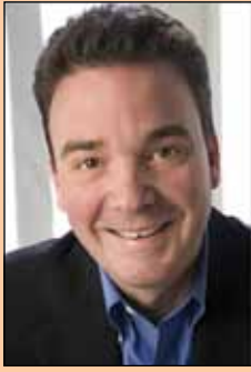
By Bob DeStefano

Do you want specific recommendations on how to turn your Website into a lead generation machine? Then, sign up for our popular Website Analysis consulting service – at no charge to you!